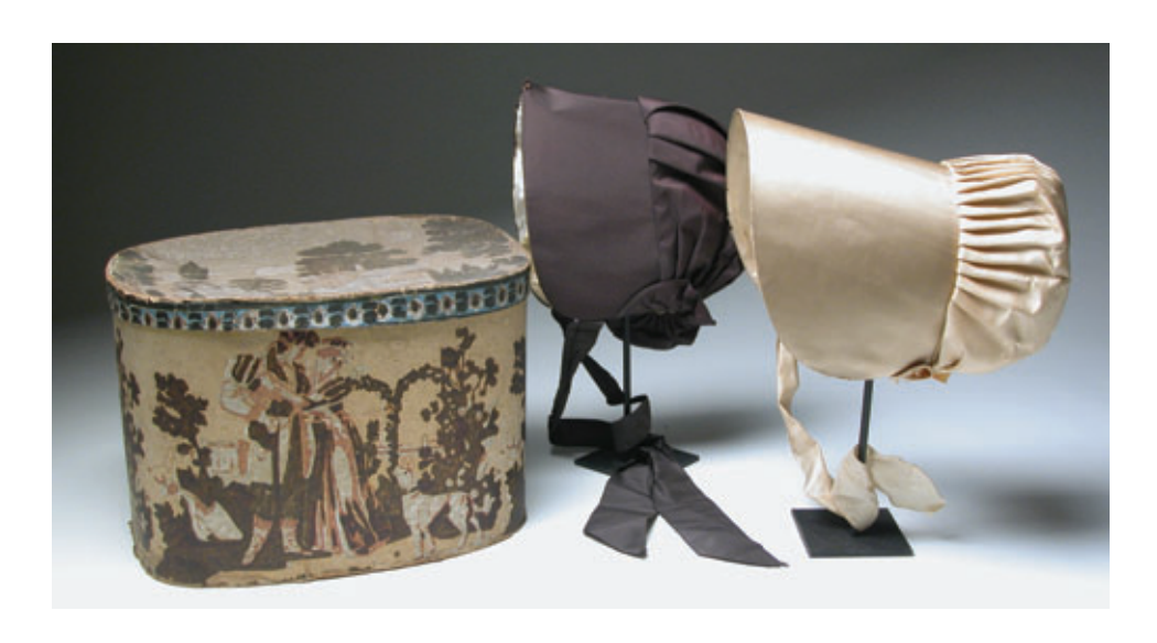
22. WALLPAPER WRAPPED HAT BOX, circa 1820, depicting a curious dog looking at a courting couple, contains two bonnets, one with New York maker's label. Height 10 ½ in. Width 16 in. Depth 12 in.