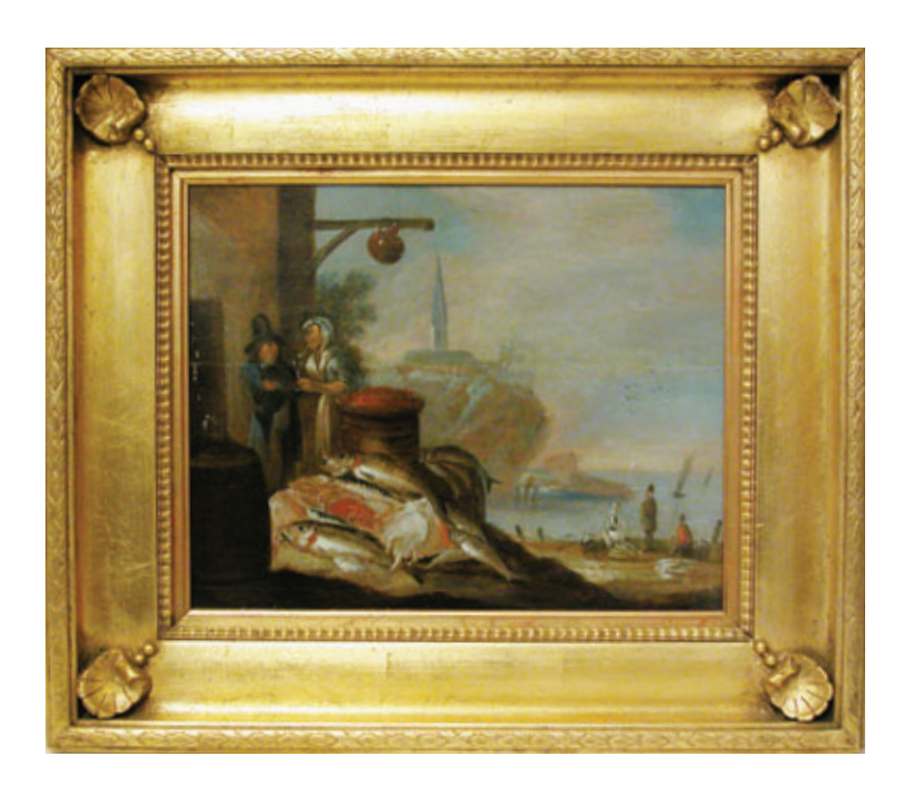
32. FRENCH SCHOOL OIL ON PANEL "Fish Monger", late 18<sup>th</sup> Century. 12 ½ in. x 16 ½ in. Provenance: Brannon's Antiques, Griffin, Georgia