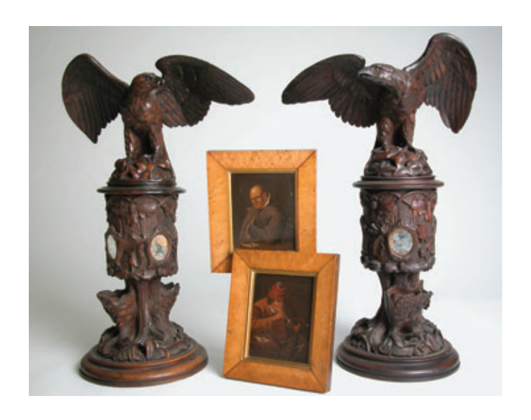
46. PAIR OF BLACK FOREST COVERED TOBACCO BOXES, circa 1880, the cover a spread wing eagle with an inquiring posture perched atop leaves and rocks, the container a tree trunk with vines and leaves. Height 22 in.

47. PAIR OF MINIATURE PORTRAITS ON PANEL OF DUTCH TRADING CAPTAINS, circa 1776 and 1780, from Captain Linskall – Portrait of a Dutch Captain who traded regularly with the North Shields and his vessel was always moored in the Dagger Rech, 1776 and Portrait of Keelman well known in the low towns of North Shields, 1780. Each man sampling tobacco in clay pipes, in period maple frames. 5 ½ in. x 4 ¾ in.