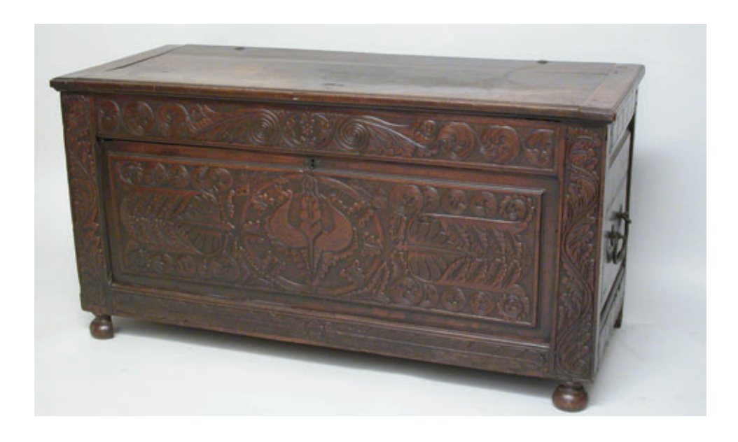
31. ENGLISH OAK COFFER, 18<sup>th</sup> Century, carved mermaid detail on front panel. Height 29 in. Length 57 in. Depth 23 in.