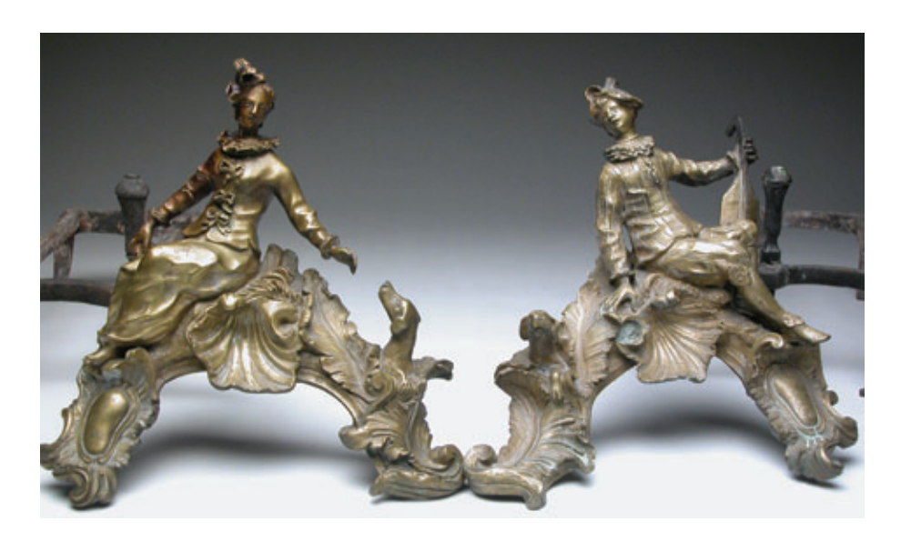
37. PAIR OF FRENCH BRONZE CHENETS, circa 1840, seated male and female figures on foliated scrolls with dogs. Height 11 in. Width 12 in.