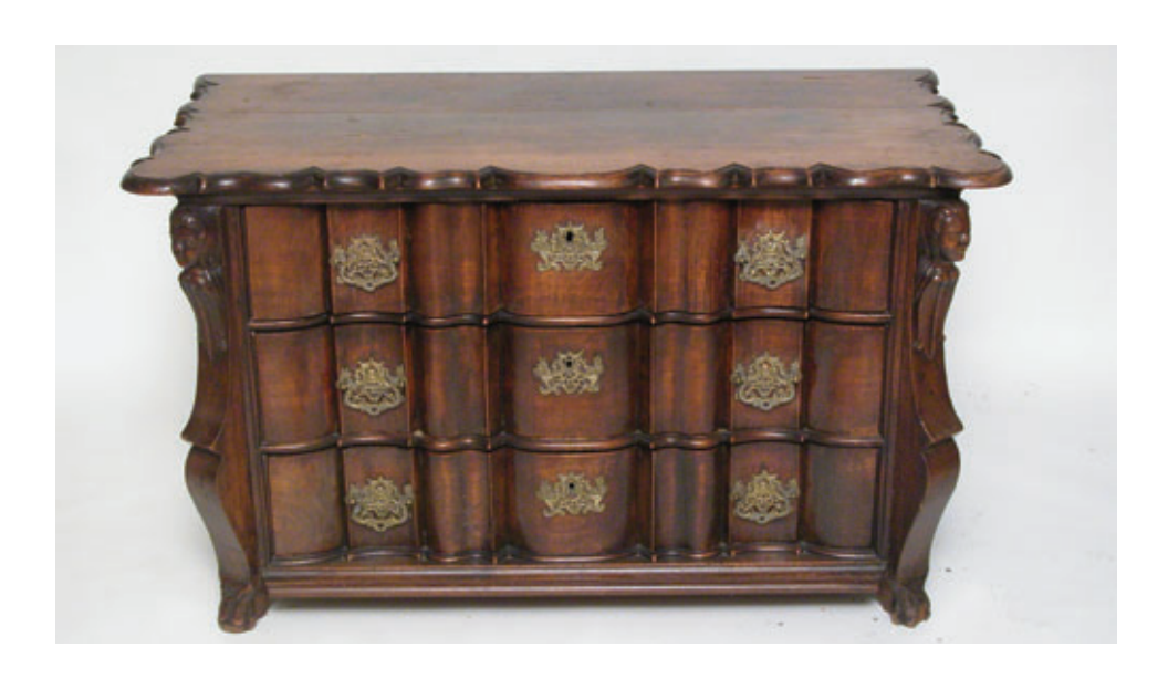
33. EAST INDIA COMPANY CARVED WALNUT MOLDED FRONT THREE DRAWER CHEST, 18<sup>th</sup> Century. Height 29 in. Width 49 in. Depth 24 in. Provenance: Black Swan Antiques, Bantam Connecticut