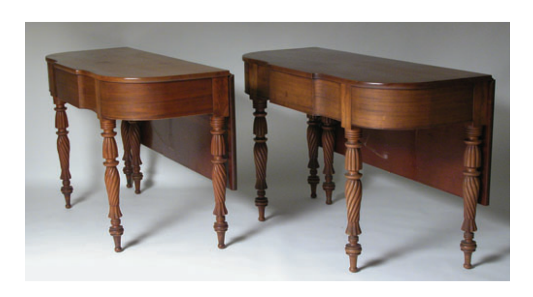
23. TWO-PART AMERICAN BLONDE MAHOGANY DINING TABLE, circa 1800, shaped top with hinged leaf on a broad conforming frieze, supported on five elaborately turned legs. Each console Height 29 in. Width 48 in. Depth 20 in. Fully open length 76 in.