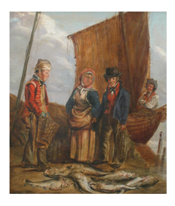
30. EUROPEAN SCHOOL OIL ON CANVAS, "Fish Mongers", early 19th Century. 15 in. x 12\frac{1}{2} in. Provenance: Brannon's, Atlanta, Georgia