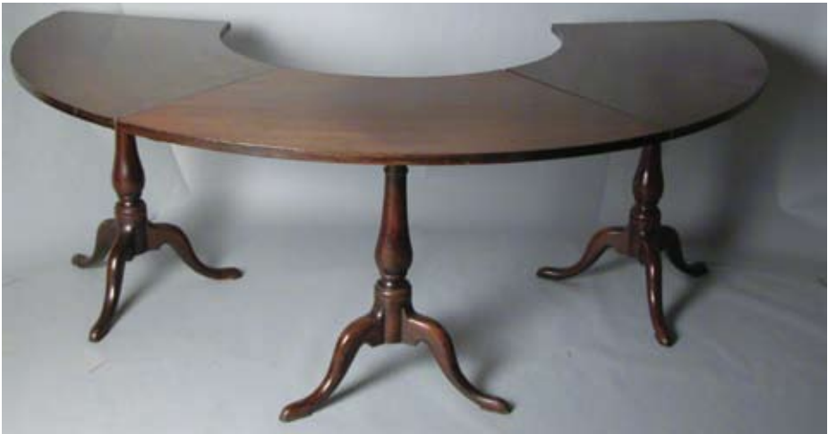
156. ENGLISH HONDURAS MAHOGANY WINE TASTING OR HUNT TABLE, 19 th Century , 1 inch thick Honduras mahogany tops are supported on three vase shaped standards ending in tripod pad feet. Height 28 ½ in. Outside circumference 162 ½ in. Interior 74 in.