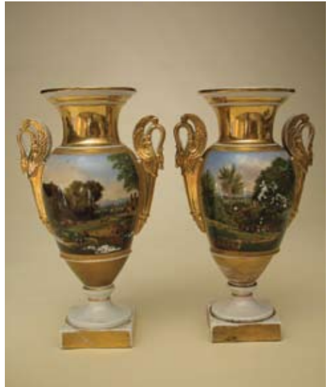
164. PAIR OF GILDED AND DECORATED OLD PARIS URNS, circa 1830-40. Height 15 ½ in.