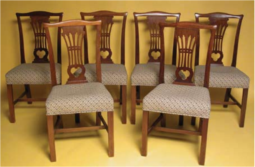
163. SET OF SIX NEW ENGLAND MAHOGANY HEPPLEWHITE DINING CHAIRS, 19 th Century.