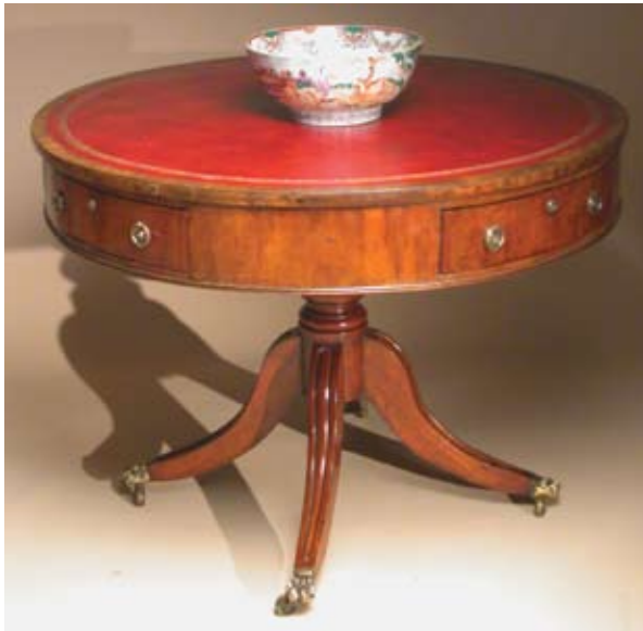
176. CHINESE EXPORT PORCELAIN PUNCH BOWL, 18 th Century, decorated with landscape and horseback riding hunters, the inner with elephant decoration. Height 5 in. Diameter 11 ½ in.