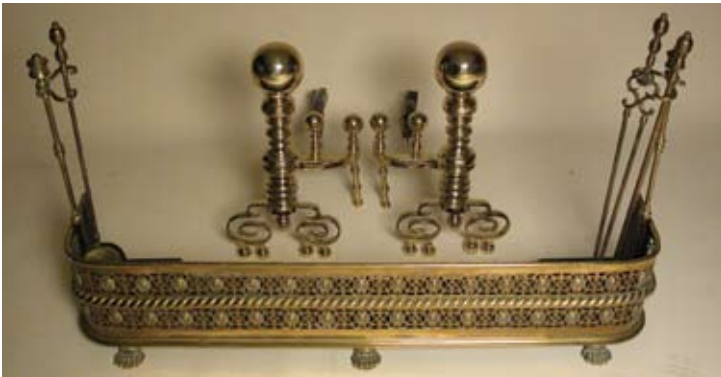
161. PAIR OF PENNSYLVANIA BRASS ANDIRONS, circa 1830. Height 22 ½ in.