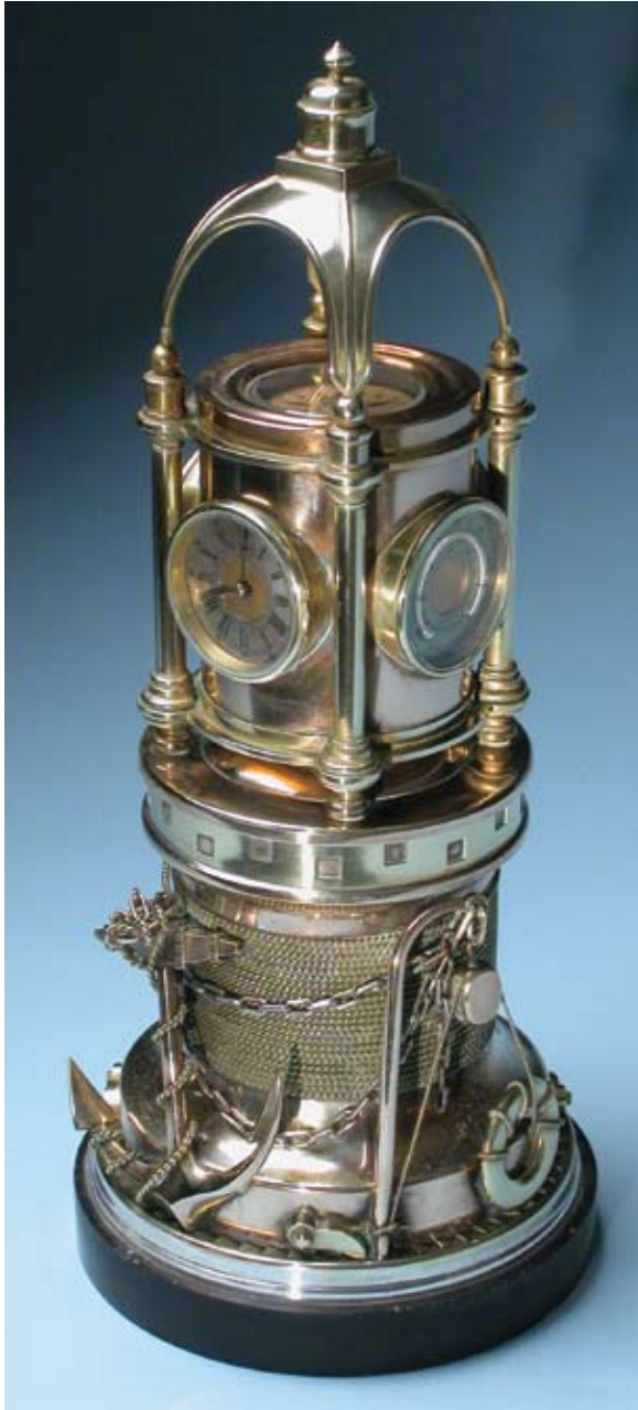
159. SCARCE AND UNIQUE MECHANICAL BRASS, COPPER, AND SILVER MARINER'S PRESENTATION CLOCK-BAROMETER, circa 1890 , spring driven movement rotates the upper dome section housing two clocks, aneroid barometer, and Reaumur Fahrenheit thermometer and a compass, supported on a capstone embellished with chains, anchor, davit, block, life preserver, and rope. Height 20 in. Base Diameter 9 in.