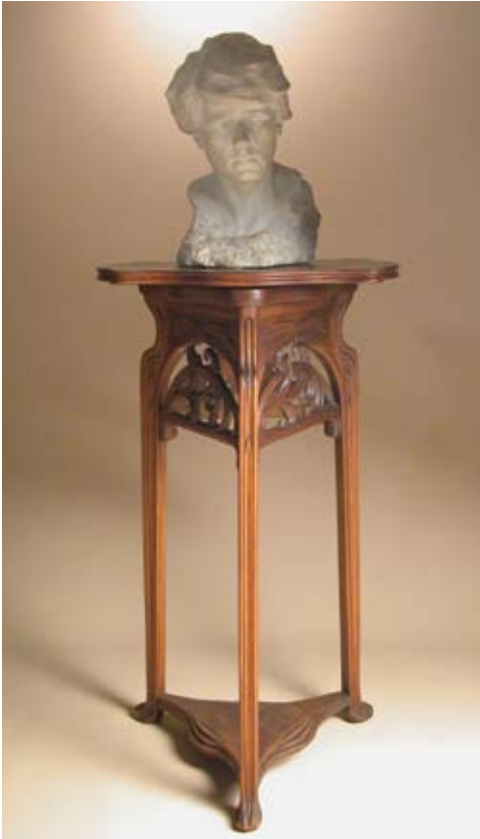
165. CARVED WHITE MARBLE BUST. Height 17 ¼ in.